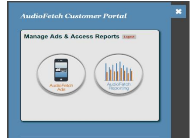
Screenshot # 2